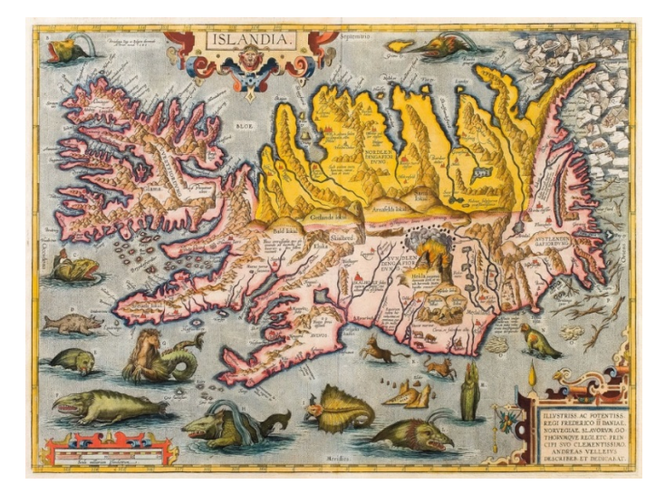
Abraham Ortelius's Iceland Map (1591)

<u>A really important note about the reading materials in this course:</u> You have one of two choices for accessing the readings in this course: You can 1) print out the articles in hard copy and physically purchase the books, or 2) obtain and read electronic versions of the articles and books. If you choose option number 2 there are caveats. First, the only electronic devices permissible for the readings are laptops or ipad-type readers. No cell phones! I am strict of this. Second, you must bring your device with you on the day that we discuss those readings. This is the price you pay for going electronic. Understand? Good.